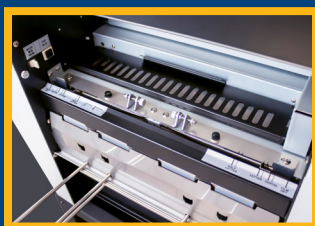
Simple-slide paper size adjustment