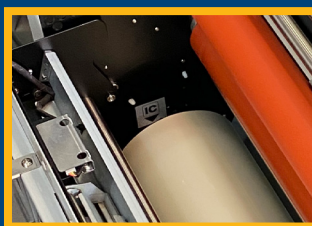
EverStick film applies settings for you