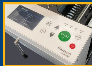
Easy-to-use color screen & controls